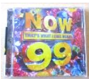
Secondary Winner Denim